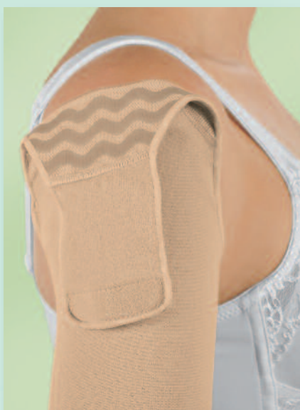
arm sleeve with silicone support